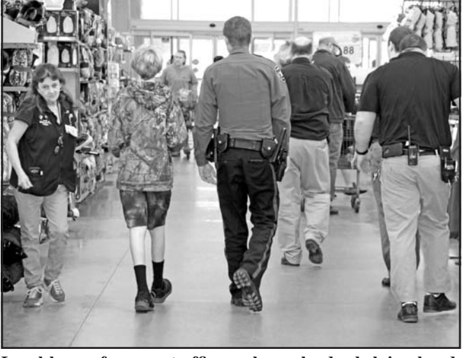
Local law enforcement officers always lend a helping hand to the Cruisers during Shop with a Cruiser.

money on the raffle tickets know where the money will be going, giving them all the more reason to buy the tickets.